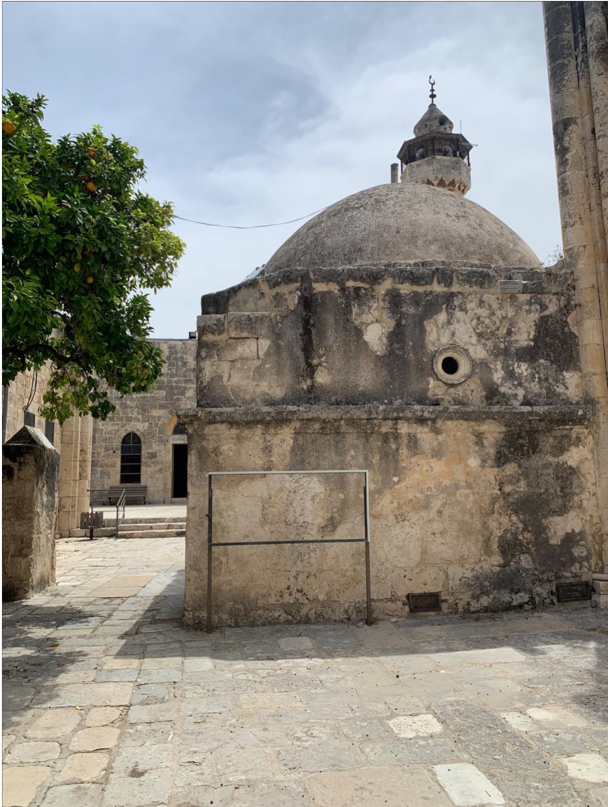
Nabi Yahya Mosque, Sebastia Town

In 2012, the State of Palestine added Sebastia (the town and mound) to UNESCO's Tentative List of World Heritage Sites, recognizing its outstanding universal value. Today, access to the acropolis—located in Area C—requires passage through the town of Sebastia in Area B. Over the past five years, settler visits, facilitated by